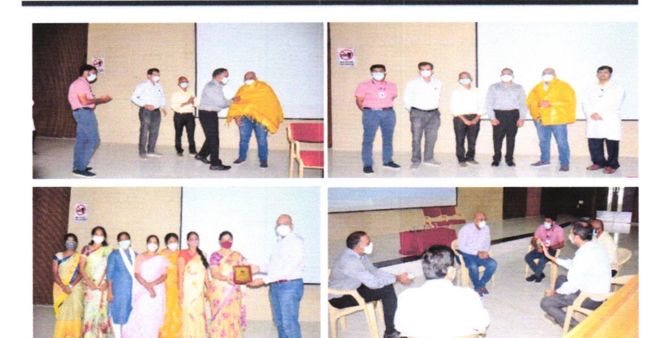
Honoring by Nursing Faculty IIC members