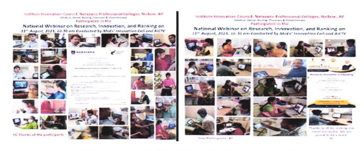
Webinar attended by Narayana professional colleges Faculty

Institute Innovation Council, Narayana Professional Colleges, Nellore, AP (Medical, Dental, Nursing, Pharmacy & Physiotherapy) Participated on National Webinar on Research, Innovation, and Ranking on 11th August, 2021, 10:30 am organized by MoEs' Innovation Cell and AICTE.