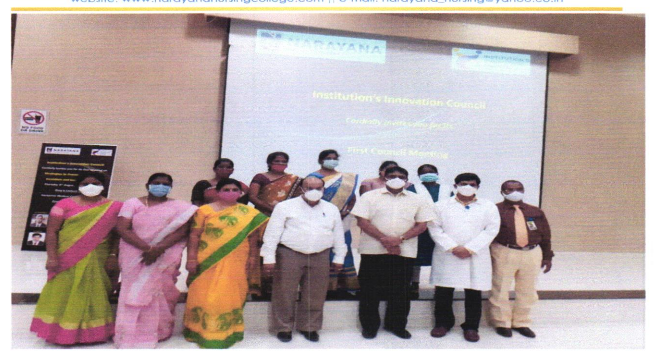
The Members of IIC Narayana College of Nursing